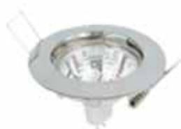
Downlight Halogen 50W. (Warmwhite)