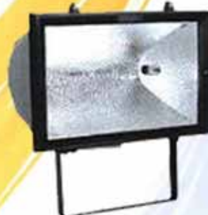
Halogen 500W. (Warmwhite)