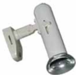
Spotlight 100W. (Standard)