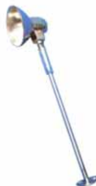
Spotlight Halogen 50W. (With Arm)