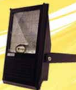
Metalhalide 150W. (Daylight)