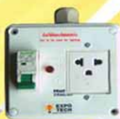
Socket 5Amp. 220v. 50Hz.