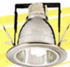
Downlight 18W. (Daylight).