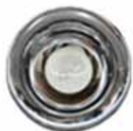
Downlight 60W. (Warmwhite)