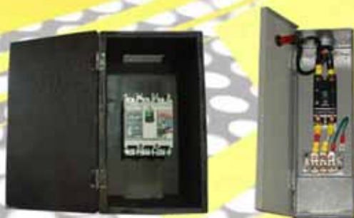
Breaker 15, 30 Amp 220V. 1Phase 50 Hz.