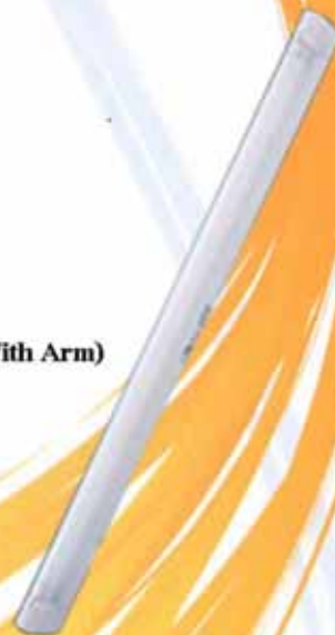
Fluorescent 1.2 M.