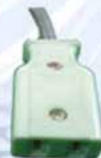
Connecting by Exhibitor

Total Utilities Solution For Event And Exposition