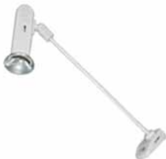
Spotlight 100W. (With Arm)